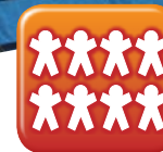
Up To 8 People