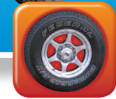
15" Alloy Wheels

(Please note: jerry can and gas bottle are for illustration purposes only)