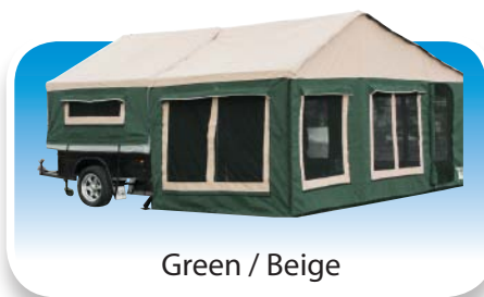
Green / Beige