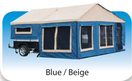
Blue / Beige