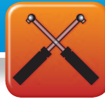
Fitted Gas Strut Kit