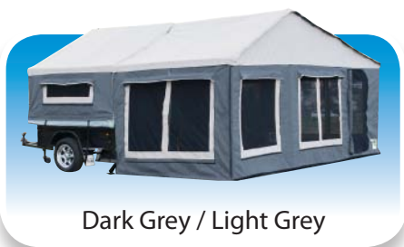
Dark Grey / Light Grey