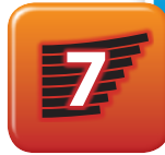
7 Leaf Springs