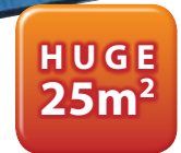
Covered Area 18' x 15'