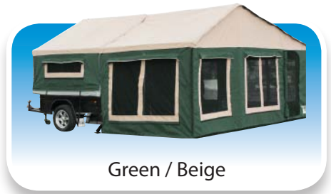
Green / Beige