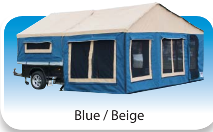
Blue / Beige