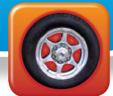
15" Alloy Wheels

(Please note: jerry can and gas bottle are for illustration purposes only)